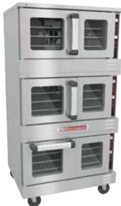
TVGS/32SC shown with optional casters

TVGS/22SC - double deck TruVection TVGS/32SC - triple deck TruVection