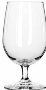
Vina Goblet No. 7513 ▲● 16 oz./47.3 cl./473 ml. H6¾ T2¾ B3¼ D3½ 1 doz./7# • .67 cu.ft. SCC 321237 TRAEX TR-6BBB □