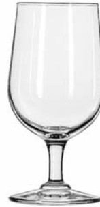
Citation Banquet Goblet No. 8411 ● 11 oz./32.5 cl./325 ml. H6 T2½ B2¾ D3 3 doz./17# • 1.48 cu.ft. SCC 129164 TRAEX TR-6BB □