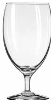
Citation Iced Tea No. 8439 ● 16½ oz./48.8 cl./488 ml. H7 T3¾ B2¾ D3½ 1 doz./8# = .74 cu.ft. SCC 018410 TRAEX TR-6BBB □