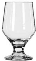
Estate Footed All Purpose Goblet No. 3312 ■ 10½ oz./31.1 cl./311 ml. H5¼ T2½ B2¼ D3½ 3 doz./21# = 1.43 cu.ft. SCC 054893 TRAEX TR-12HH □