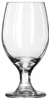
Perception Banquet Goblet No. 3010 ■ 14 oz./41.4 cl./414 ml. H6½ T2¾ B3 D3¾ 2 doz./17# • 1.33 cu.ft. SCC 055118 TRAEX TR-6BBB □