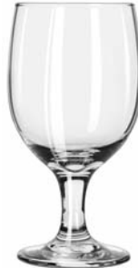
Embassy Goblet No. 3711 ■ 11½ oz./34.0 cl./340 ml. H6½ T2¾ B2¾ D3¼ 2 doz./13# • 1.07 cu.ft. SCC 369987 TRAEX TR-12HH □