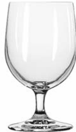
Bristol Valley Goblet No. 8556SR ✖ 12 oz./35.5 cl./355 ml. H5½ T3 B2¾ D3¾ 2 doz./13# • 1.01 cu.ft. SCC 457250 TRAEX TR-6BB □