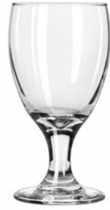
Embassy Royale Banquet Goblet No. 3721 ■ 10½ oz./31.1 cl./311 ml. H6 T3 B2¾ D3¼ 3 doz./22# • 1.57 cu.ft. SCC 556755 TRAEX TR-12HH □