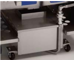
Filter pan is designed for maximum oil return.