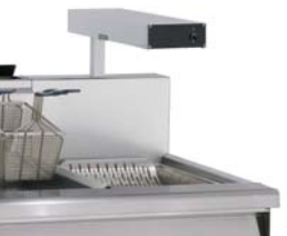
Side Car includes a stainless steel cabinet with a drain area, food warmer and dump pan.