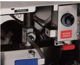
5.5 GPM, 1/3 HP roller pump speeds up filtering process.