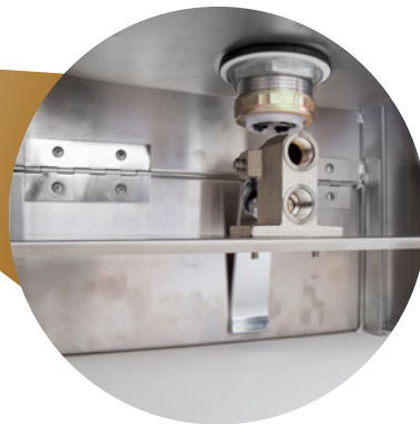
KNEE ACTIVATED FAUCET WITH HINGED FRONT APRON